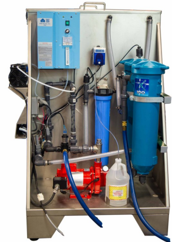
H203 Filters/LNC injection

Additionally, the touchscreen allows the user to control settings such as