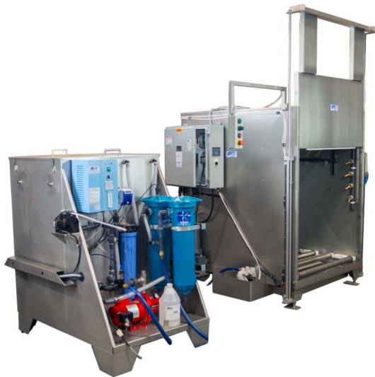
H203-150SS w/WCA Wash Cabinet

The H203-150SS, combined with an MTC wash cabinet or MTC wash rack, forms a closed loop system that contains and controls the water used for rinsing batteries. Rather than the water going to wastewater storage, it is pumped back into the reservoir to be used again repeatedly.