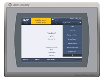
Auto/Manual Control w/PanelView Plus 7" Screen