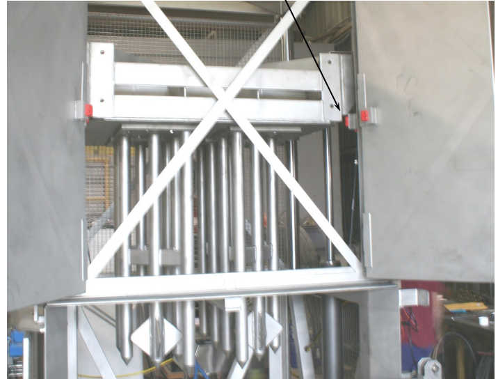
16 Solid Round Spikes (2-1/2" Dia.)

Safety Switch Prevents Doors from Opening during Operation