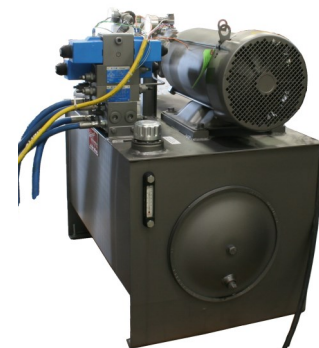
15 HP, 17 GPM, 50 Gal Reservoir Hydraulic Power Unit

Contact the MTC Sales Team at (254) 298-2900, or our website www.gomtc.com