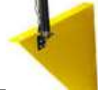
Mounting Tab (CSW-BCR58H-MT)