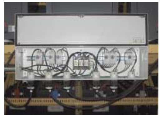
DP-6 (Top Opened)

Constructed from the Finest Quality Components Including NEMA Industrial Grade Enclosures Breakers Distribution Blocks Coupled with Twist-Lock Plugs Grounding Provisions, Stringent Product Safety Standards Safe and Cost Effective Method of Power Distribution. Additional Lock-Out Tag-Out Capabilities