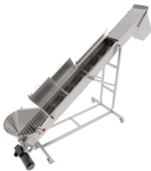
MTC MTCS Series

MTC Belt Conveyors are custom made, come in many different widths, and lengths, and are available in stationary or portable models. Their stainless-steel construction ensures long life and ease of sanitation. MTC conveyor belts vary in style based on the job requirements. All belts are non-porous, non-absorbent PVC to help prevent contamination. Standard Conveyors come with push-button controls but can be automated using a PLC to streamline your process. Conveyor options include reversible motors, rare earth magnets, or metal detectors