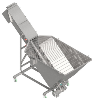
MTC MTCS Series

MTC Screw Conveyors are designed to move frozen and fresh product from one location to another. They come in various configurations, including portable and stationary. MTC Screw Conveyors are available in diameters from 6-inches to 24-inches to fit your needs. All units feature stainless steel construction, sanitary design, grates and hinged trough covers with safety interlocks. Additional safety features include door and grate latches. Options include reversible motors and rare earth magnets.