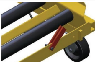
Battery Safety Stop

*REQUIRES SAFETY ATTACHMENT SUPPLIED BY CUSTOMER TO SECURE TRANSPORTER TO TRUCK WHEN CHANGING BATTERY