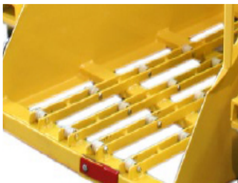
Low Profile for 3" Load-In Height(-LP)