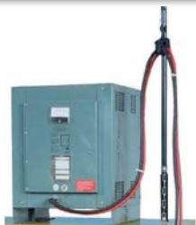
Optional Battery Cable Retractor (BCR-58H)